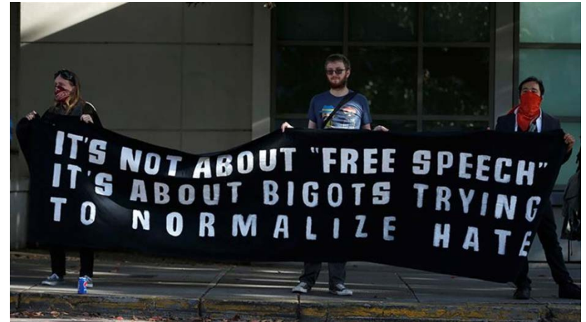
Anti-fascist activists protest at UC Berkeley (2017)