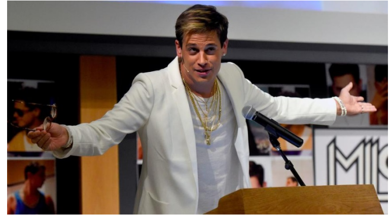
Milo Yiannopoulos speaking at U. Colorado Boulder