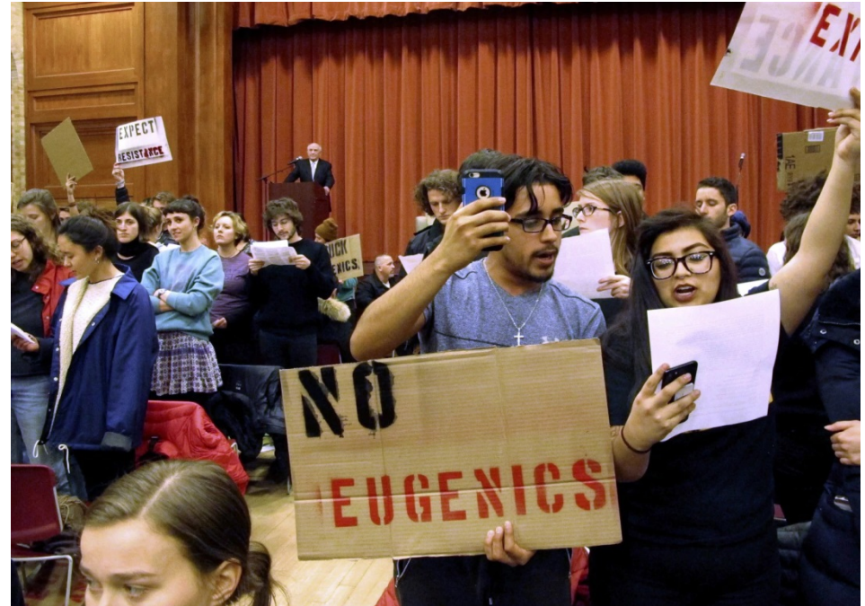
Students protest at Middlebury College