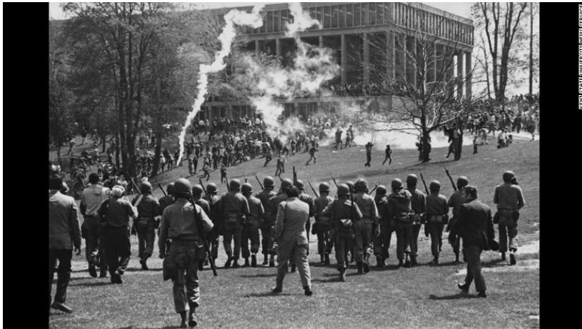
National guardsmen disperse protestors at Kent State (1970)