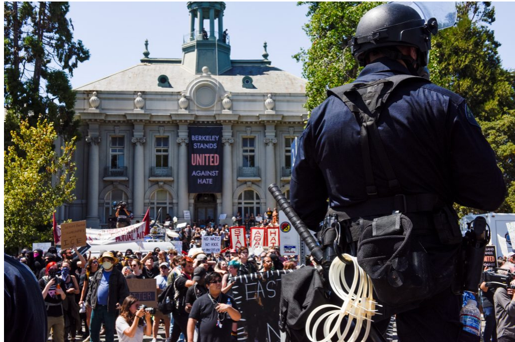
Security watches over protests at Berkeley